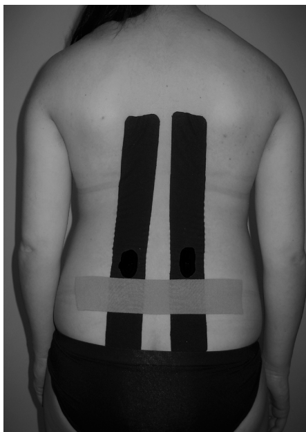
Figure 1. Kinesio Tex Gold applied on the lumbosacral area

Elastic tapes were applied in areas with the greatest mobility of the thoracolumbar fascia relative to muscles below (Fig. 1).