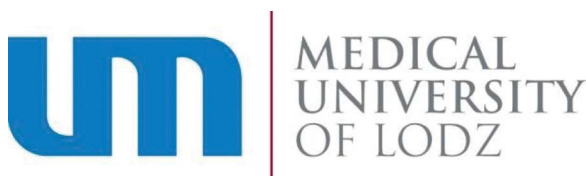
Figure 3. Medical University of Lodz — logo

The study was funded by the Medical University of Lodz, Research Task No: 502-03/1-004-02/502-14-092 (Fig. 3).