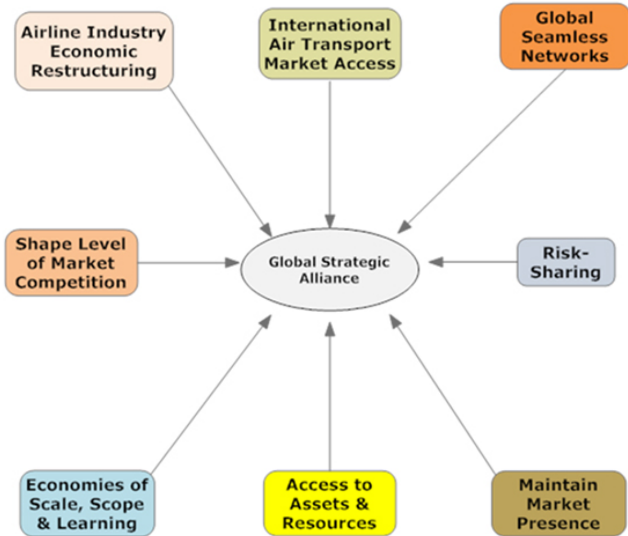
Figure 1. The factors influencing the formation of strategic alliances and joint ventures in the global airline industry.

alliances is, in many instances, the only available form of market entry available to them.[43]