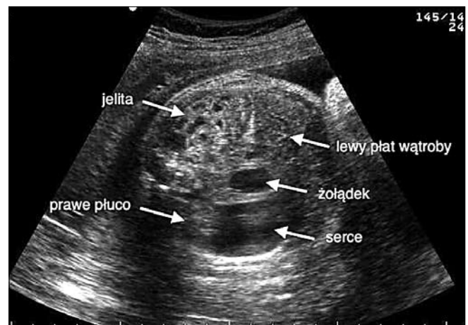
Figure 1. Sonographic cross-section of foetal thorax at 36 weeks gestation.

Additionally, there was dextrocardia, unobstructed drainage of the pulmonary veins from the right lung to the left atrium, left lung was not visible, and there was normal function of both ventricles. At 27 weeks the left lobe of the liver was found to be above the diaphragm. The LHR at 20 weeks was 1.9; amniotic fluid index (AFI) was 22. At 36 weeks LHR was 1.9 and AFI was 25. (Figure 1).