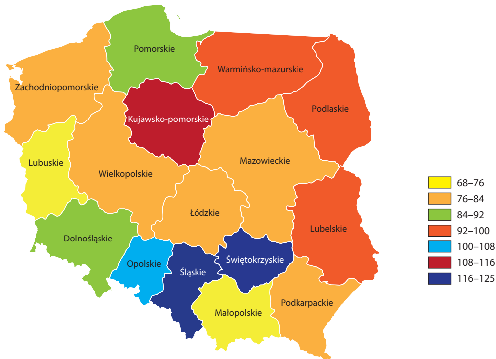
Figure 1. Average annual prevalence indicator for patients with C54% in Poland over the analysed period