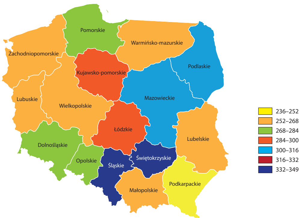
Figure 2. Periodic prevalence indicator for the 5 year period of observation

amounted to 2085 persons, (Fig. 3). The median observation time was 28.66 months, standard deviation 0.60 month with a 95% confidence level.