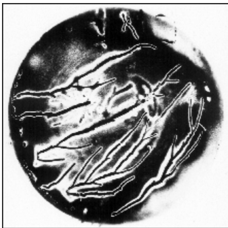
Fig. 1: Electrostatic discharge structure for poling time 1min. and voltage -8.5\text{kV}

To our knowledge, the first author to report the channel structure of electrostatic separation discharges on the surface of polyethyleneterephthalate was Bertain [3]. She presented a picture (Fig.7 in [3]) showing the 'charge distribution obtained when a negatively charged foil of Mylar is removed far from an earthed plate'. The clearly depicted and ramified channel structure is very similar to that in our Fig. 1. Similar