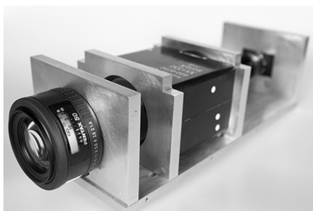
Fig. 1: System inner housing with installed components

This paper describes the evolution of the current project to replace analog S-VHS camcorders with a new design in which gigabit ethernet cameras are used. The direct digital output will have many advantages in the enhanced parameters of the system, and especially in the advanced automation of the observation process.