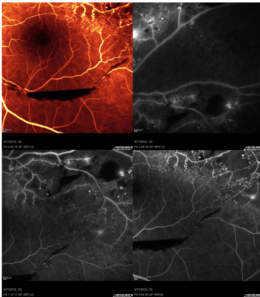
FIGURE 3. Left eye's image through the fluorescein angiography

The findings are compatible with Eales' disease, which is found at the late stage of retinal