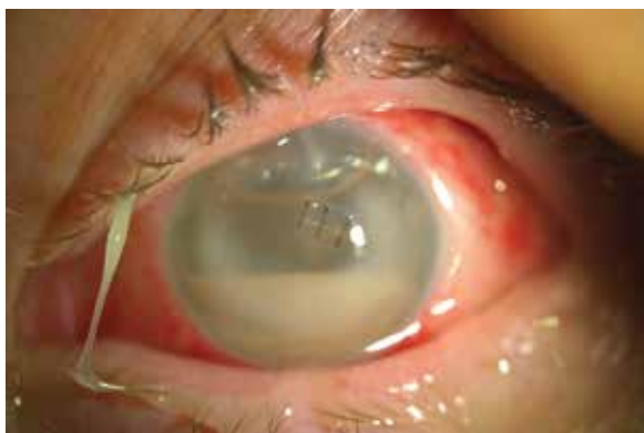
FIGURE 1. The eye condition on the date of admission