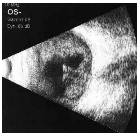
FIGURE 2. Dense opacities in vitreous body seen in ultrasonography

On the day of admission to our clinic a 20-G three-port pars plana vitrectomy (PPV) with phacoemulsification and vancomycin administration was performed. The operation was abandoned due to visualisation constraints. The vitreous obtained during the surgery was sent to the laboratory for microbiological tests. The patient was treated empirically with intravenous cefazolin and topical moxifloxacin and natamycin. Microbiological tests revealed Staphylococcus epidermidis and Bacillus sp. sensitive to current treatment. Four days later 20-G PPV in combination with penetrating keratoplasty with use of temporary keratoprosthesis and