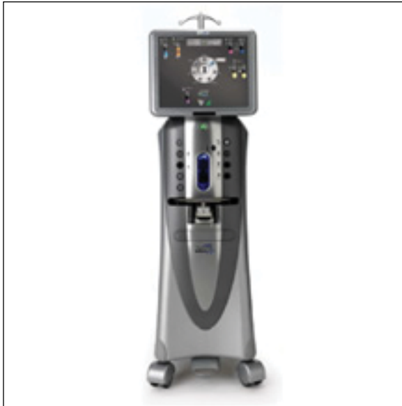
FIGURE 1. Stellaris Vision Enhancement System for phacoemulsification