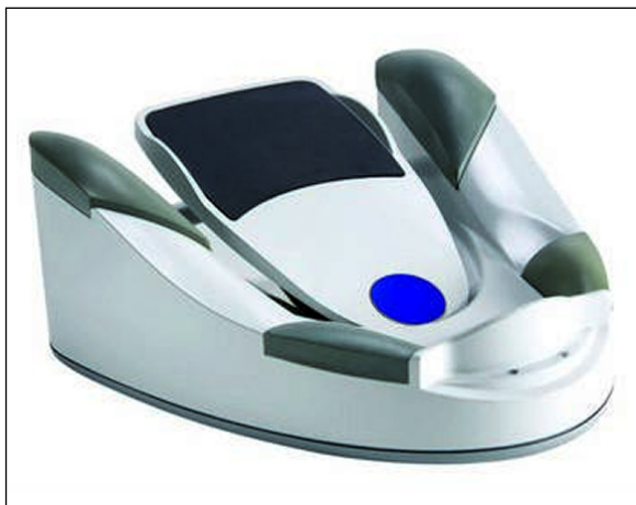
FIGURE 3. Dual linear foot pedal

with Stable Chamber is only obvious when the tip is occluded. At that time, flow stops and vacuum migrates to the tip, with 600 mm Hg vacuum holding force to facilitate chopping or quadrant removal. Then, as the nucleus is aspirated, the eye is protected from high vacuum surge by the flow restriction of Stable Chamber tubing.