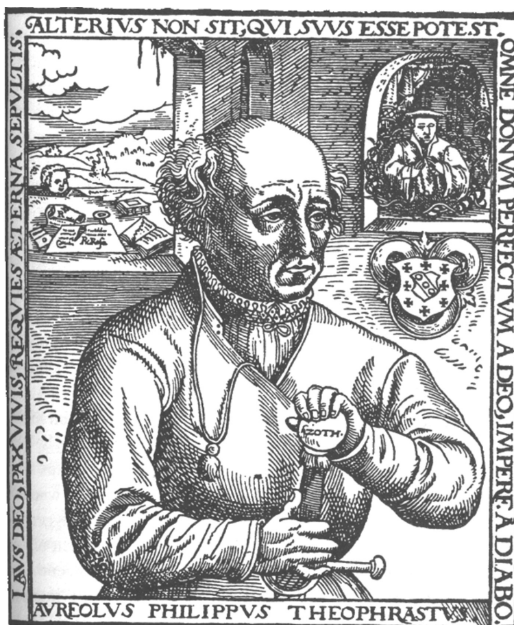
Figure 3. Paracelsus (1493-1541) a metallurgist turned physician. His real name was Theophrastus Phillipus Aureolus Bombastus von Hohenheim but he chose call himself Paracelsus. This means greater than Celsus (c. 25 BC – 50 AD), the famous physician of ancient Rome. Paracelsus made the statement that 'the true use of chemistry is not to make gold but to prepare medicine' and added greatly to the knowledge of compounds.