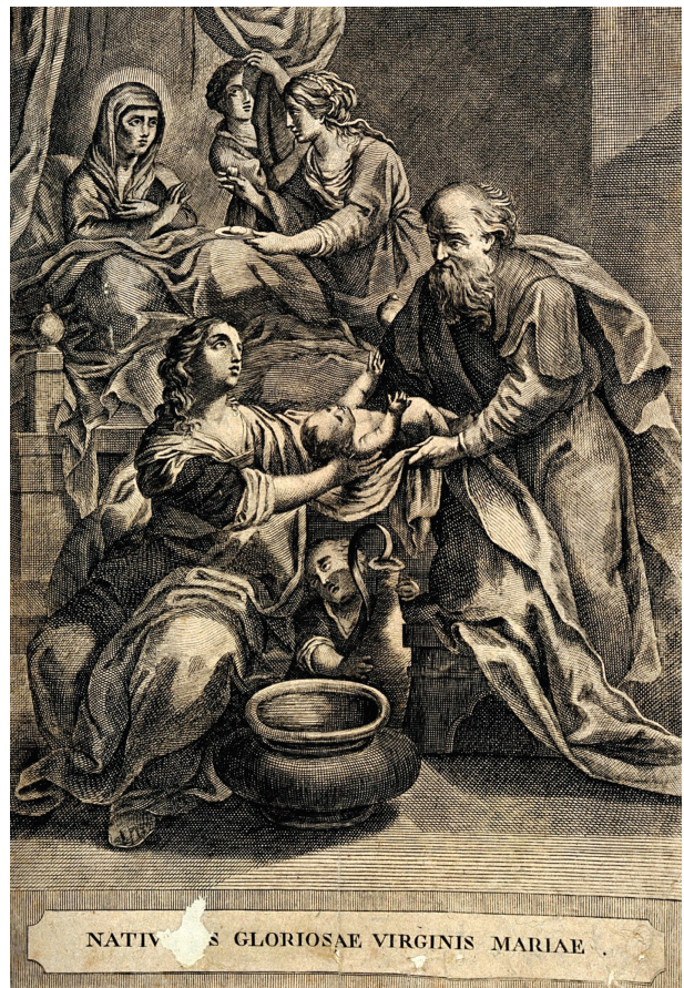
Figure 1. A midwife handing the Virgin Mary to Saint Joachim after her first bath. Saint Anne, the mother of the Virgin Mary is in bed recovering from the birth. The lettering in this line engraving states 'Nativitas gloriosae Virginis Mariae'

Without access to St. Joachimstal pitchblende (in the German language pech means pitch or bad luck), radium