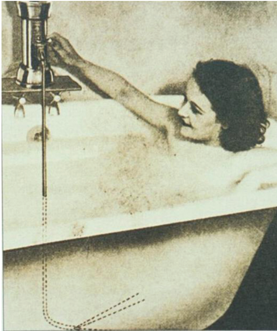
Figure 7. A radon bath of the type which was very popular until the 1930s. The radon Emanator (or Revigatorator or radon generator: there were probably more than 10 types of such device, with different commercial names, containing small amounts of radium) is clearly seen. A tap is used to deposit 'radon water' into the bath.