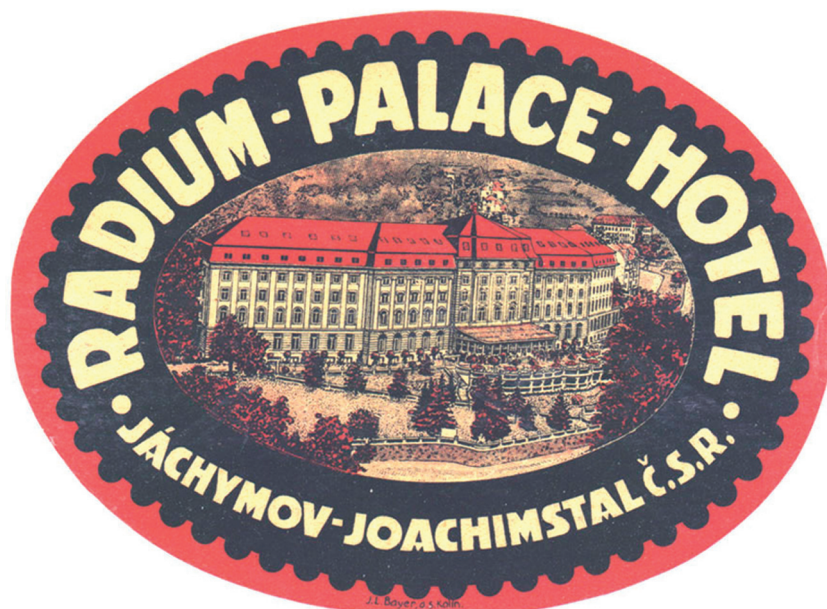
Figure 8. Luggage tag from the Radium Palace Hotel in St. Joachimstal