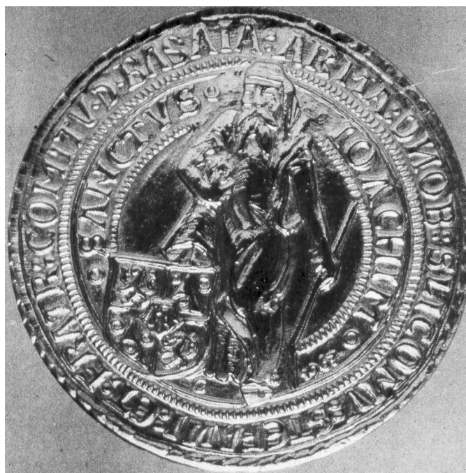
Figure 6. A silver taler: the figure on the coin is St. Joachim [8]

were Rijksdaalders, in Denmark Rigsdaler, in Italy Tallero, in Poland Talar, in France Jocandale, in Russia Jefimok (Figure 6). Until the discovery of the extensive silver deposits in Mexico and Latin America, the mint with the largest output of silver coins remained St. Joachimstal.