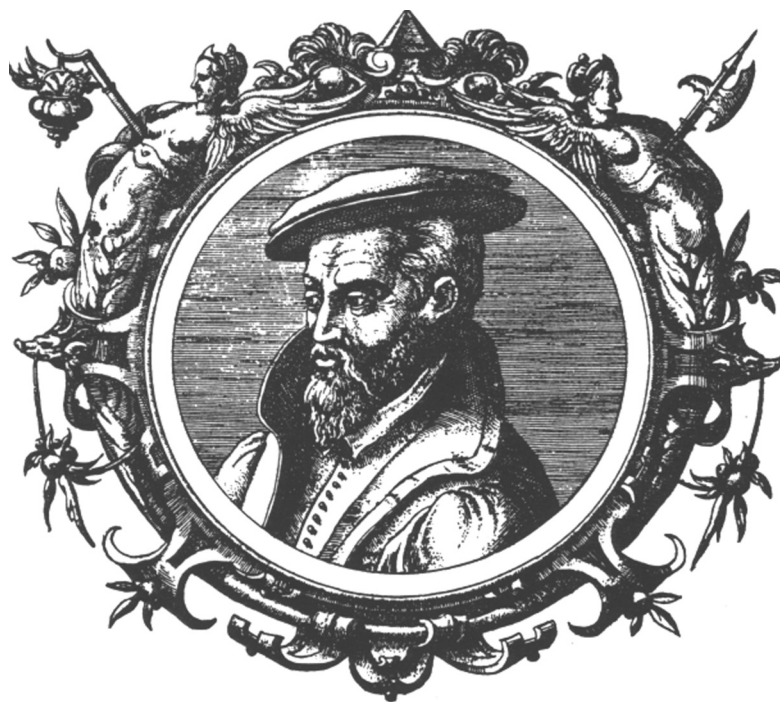
GEORG BAUER (AGRICOLA)

Agricola also ascribed the disease to the inhalation of dust, and it was not until 1879 that Bergkrankheit was correctly identified as lung cancer and not pulmonary tuberculosis or silicosis [6]. Agricola described improved methods of ventilating the mine shafts by the complex use of horse-powered and water-powered bellows rather than by the employment of men to continuously shake linen cloths along the passages. He also recommended the wearing of loose protective veils of fine netting, which the miners; women folk were taught to make [7]. However, it was only in the 1920s that radon gas was suspected as the causative agent.