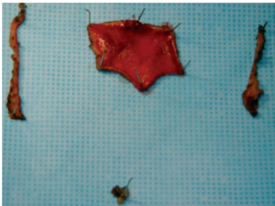
Figure 3. The surgical specimen after Transanal Endoscopic Microsurgery

of Hermanek and Gall introduced in 1986, the results of local excision are comparable with those achieved by radical surgery [2, 14, 24]. In the follow-up local recurrence and/or distal metastases were found in 3/42 cases (7.1%). In the Tis subgroup there was 1 case of local recurrence (4%). In the T1/T2 subgroup there were 2 (11.8%) recurrences (liver metastases) and 2 patients died due to disease progression. The results obtained in our patients are similar to reported by other authors [2, 11, 14] and indicate the necessity of careful patients qualification to TEM procedures. Two cases of distal metastases (11.8%) make the use of TEM in patients with T2 or more advanced rectal cancer questionable. The neoadjuvant radiotherapy was applied with the intent of sterilising the structures of the mesorectum. Due to small number of patients who underwent preoperative radiotherapy the effect of this treatment is not clear. However, some benefits – such as downstaging or even a total response, i.e. disappearance of cancer cells were observed. Though some authors reported significantly improved long-term results after neoadjuvant radiotherapy [3, 21], comparable with the results of radical surgery, in the prevalent number of studies the results are comparable with ours [3, 21, 22, 27, 28]. The results obtained in our study are promising and should be analyzed in further clinical trials.