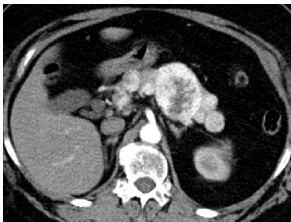
Figure 4. Hypervascular lesions in the pancreas — neuroendocrine cancer (multifocal)

(Radiological picture of clear-cell carcinoma metastases in the pancreas and pancreatic neoplasm (multifocal) is indistinguishable)