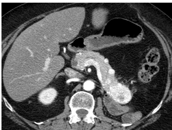
Figure 3. Hypervascular lesions in the pancreas — metastases of clear-cell carcinoma of the kidney