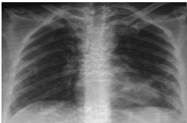
Figure 2. Chest X-ray (PA view) showing cavitary lesions in the left lower zone