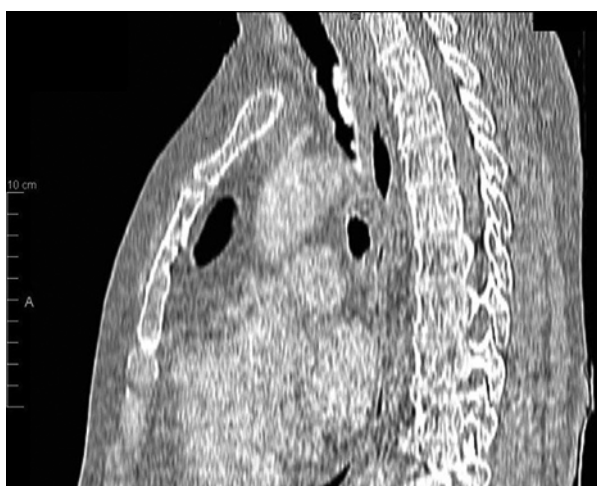
Figure 2. CT reconstruction in sagittal plane shows multiple protruding nodules in trachea

the front and side walls of the trachea along the entire length and on the main bronchi as on Figure 3.