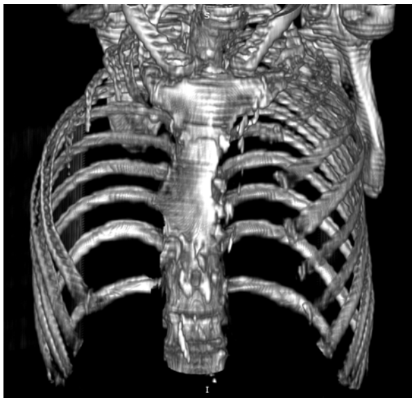
Figure 3. Bony window in 3D reconstruction

Poland Syndrome was first described in 1841 by Sir Alfred Poland, an English surgeon. Its incidence is estimated between 1:35,000 and 1:50,000 [1]. It consists of a rare, congenital anomaly associated with absence of the pectoralis major muscle [1] and upper limb ipsilat-