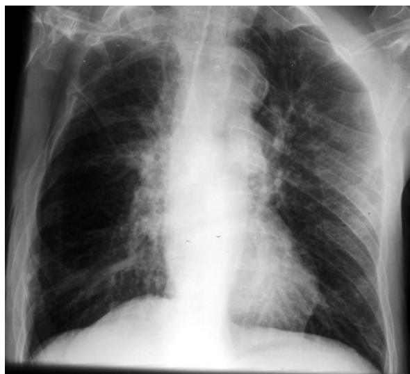
Figure 1. Chest X-ray showed right hyperlucent hemithorax

A 65-year old male, current smoker (60 pack-years) with medical history significant for chronic obstructive pulmonary disease (COPD) was admitted to our department complaining of shortness of breath, cough and increased purulent sputum production. Physical examination revealed wheezing and prolonged forced expiratory time, proposing the diagnosis of acute exacerbation of COPD. Additionally, aplasia of the pectoralis major muscle and ipsilateral symbrachydactyly were also observed. Chest X-ray showed right hyperlucent hemithorax (Fig. 1). Chest computed tomography confirmed the asymmetry of the chest with absence of the pectoralis muscles and costal cartilage of ribs 3 through 5 on the right hemithorax (Figs 2–4), suggesting the diagnosis of Poland Syndrome, a rare congenital malformation.