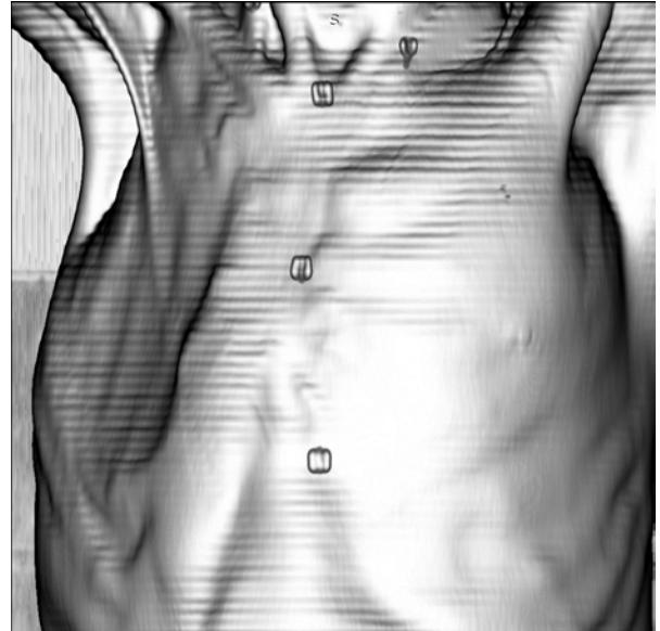
Figure 4. Chest wall 3D reconstruction

Poland Syndrome was first described in 1841 by Sir Alfred Poland, an English surgeon. Its incidence is estimated between 1:35,000 and 1:50,000 [1]. It consists of a rare, congenital anomaly associated with absence of the pectoralis major muscle [1] and upper limb ipsilat-