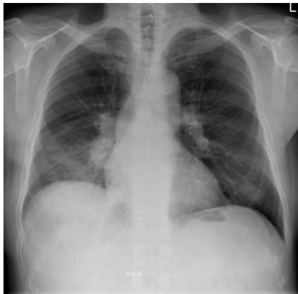
Figure 1. Chest X-ray. Opacities in the right lower zone and widened right hilum and mediastinum

He was admitted in moderate condition, with dyspnea, exhausting cough and weakness; blood