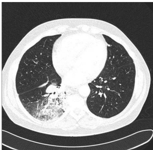
Figure 2. Lung HRCT. Parenchymal consolidations with ground glass opacities in right inferior lobe with a sign of air bronchogram

no response after eight days of treatment; on chest X-ray progression of shadowing in lower right zone was revealed. Decision to perform open lung biopsy via thoracotomy was made. A wedge resection of posterior basal segment of right lower lobe was performed, the lung was in state of hepaticization; also samples of subcarinal lymph nodes were resected. The patient's recovery was good.