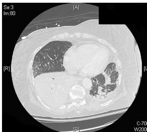
Figure 1. Computed tomography of the chest, showing a dense right lower lobe infiltrate and a less prominent left lower lobe infiltrate

Sputum gram stain showed gram-positive branching rods, suspicious for Nocardia species (Fig. 2), which was later confirmed in culture as N. asteroides . Antibiotics were switched to trimethoprim-sulphamethoxazole IV 5 mg/kg every 8 hours. The patient was discharged with a diagnosis of pulmonary nocardiosis and took trimethoprim/sulphamethoxazole 800/160 mg 2 tabs 3 times a day with the plan to continue this therapy for 3 months. The patient improved clinically, but she developed urticaria on the chest, abdomen, back, and extremities after about 1 month of therapy. At this point, her therapy was switched to minocycline 100 mg twice a day for an additional two months. No follow-up CT chest was performed, but a chest X-ray 4 months later showed resolution of right lower lobe pneumonia. She continued to use home oxygen therapy.