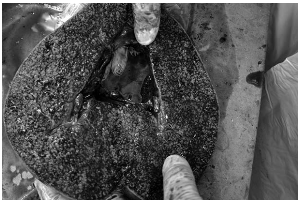
Figure 2. Spleen mycobacteriosis (autopsy specimen). The picture shows multiple nodules crumbling whitish cream-colour

Rycina 2. Mykobakterioza śledziony (materiał sekcyjny). Na zdjęciu widoczne mnogie rozpadające się guzki barwy białawo kremowej