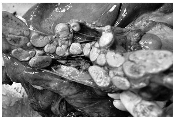
Figure 3. Intra-abdominal lymph nodes mycobacteriosis (autopsy specimen). The picture shows significantly enlarged intra-abdominal lymph nodes packages

Due to a lack of obligation to report mycobacteriosis cases to the register, data concerning the prevalence of the disease in Poland are underestimated. According to American statistical data, the incidence of mycobacteriosis worldwide ranges from 1 to 1.8 per 100,000 persons [21]. Patients with acquired or congenital immunodeficiency syndromes, and, among them, the population of HIV-infected patients, are the high risk group for mycobacteriosis and for death due to the disease [22, 23]. In the present study, two out of four cases of diagnosed mycobacteriosis ended with death. In one case mycobacteriosis of Mycobacterium kansasii aetiology was diagnosed in a Vietnamese citizen, in whom HIV infection was diagnosed at the same time (the so-called late presenter).