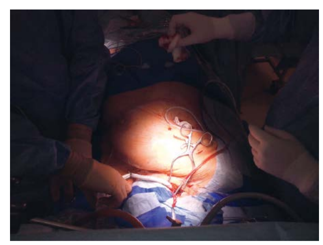
Figure 4. Cannulation of right jugular vein and carotid artery for extracorporeal circulation