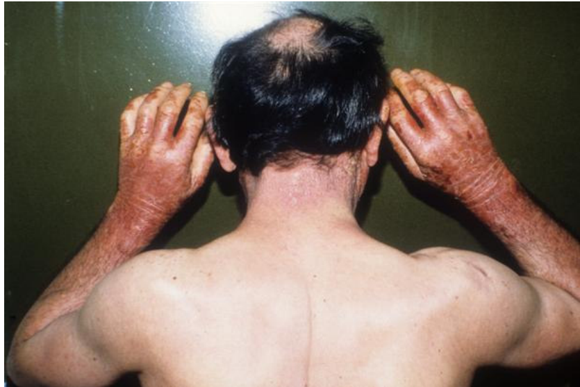
Eczema on sun-exposed areas (neck, forearms and hands). Case Nr 3.