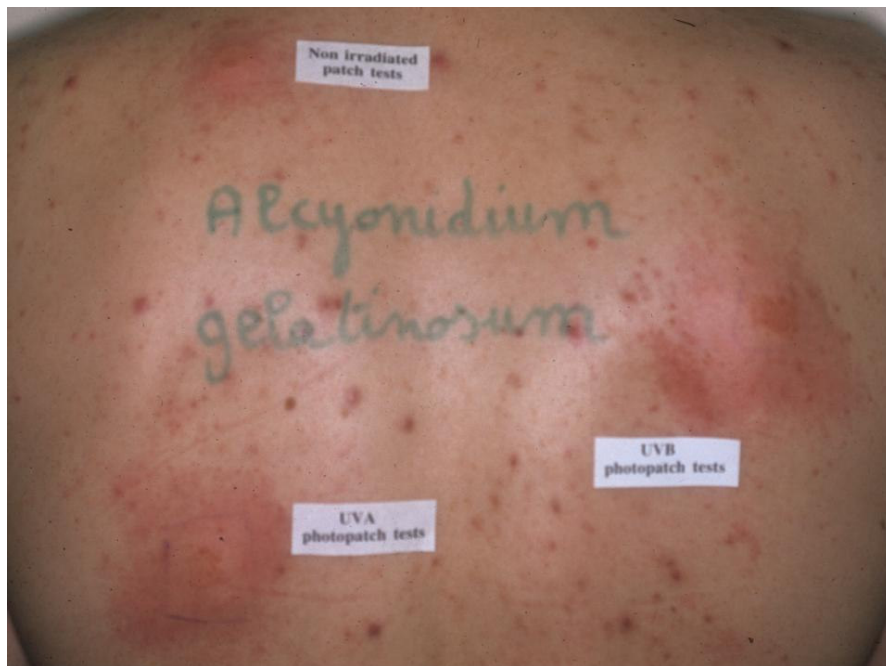
Positive patch and photopatch tests to Alcyonidium gelatinosum (case Nr 1)

After lesion healing, epicutaneous tests were performed, evidencing an extremely intense reaction to Alcyonidium gelatinosum (Fig.1a). Photobiological exploration with a solar simulator revealed severe photosensitivity. The Minimal Erythematous Dose (MED) with regard to ultraviolet B (UVB) and A (UVA) radiation was reduced: UVB MED < 27 mJ/cm 2 (N ≥ 50), UVA MED 14.6 J/cm 2 (N ≥ 25).