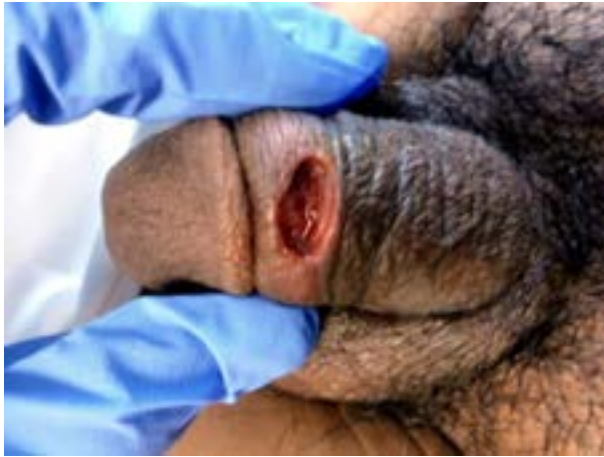
Figure 1. 20 × 9 mm ulceration on crew member's dorsum penis resulting from foreign body removal

their revenue. It is therefore reasonable to deem these procedures as someone's side job. The obvious concerns are the level of expertise of the individual performing these procedures as well as the quality and safety of the materials and instruments employed.