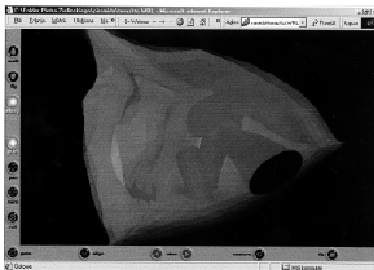
Figure 4. Screenshot of the virtual pyramids, which can be rotated, looked-through, magnified.