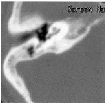
Figure 2. Tomographic x-ray scan of the petrous bone.