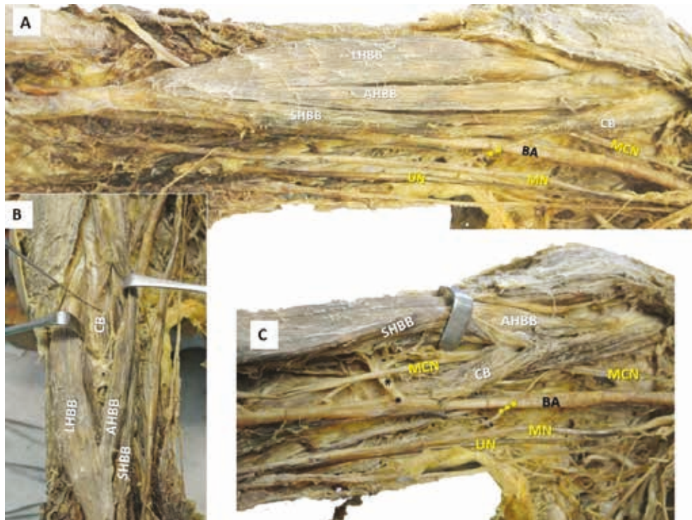
Figure 1. A. A three-headed biceps brachii muscle (BB) with the long, short and accessory heads (LHBB, SHBB and AHBB) combined with a two-headed coracobrachialis muscle (CB) with an accessory muscular bundle; C. The musculocutaneous nerve (MCN) connecting branch (***) initially coursed under the accessory muscular bundle, then advanced superficially to the brachial artery (BA) to ultimately reach and merge with the median nerve (MN); B. MCN innervated and BA supplied the atypical BB (**); UN — ulnar nerve.

diversities of the coracobrachialis muscle (CB) [14]. Knowledge of anatomical variants in neurovascular and muscular structures is fundamental in interpreting imaging studies or unusual clinical manifestations.