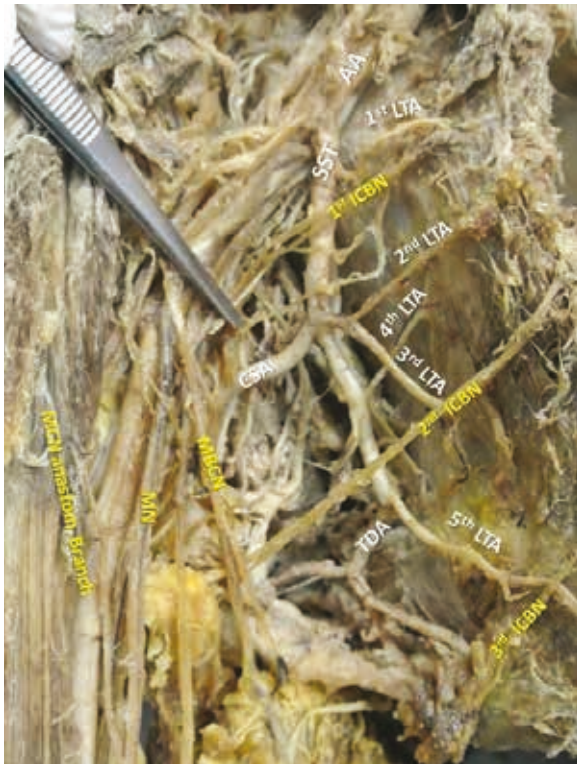
Figure 3. The subscapular arterial trunk (SST) coexisted with 5 lateral thoracic arteries (LTAs) and 3 intercostobrachial nerves (ICBNs). The 1 st LTA coursed anterior to the 1 st ICBN and the 2 nd , 3 rd , 4 th and 5 th LTA originated via a common trunk with the circumflex scapular artery (CSA) and the thoracodorsal artery (TDA); MCN — musculocutaneous nerve; MN — median nerve; MBCN — medial brachial cutaneous nerve.

es in these cells induce muscle development. Further growth of muscle occurs by fusion of myoblasts and myotubes. Variation of muscle patterns may be the product of altered signalling or stimulus between mesenchymal cells. A first hypothesis supports that the accessory BB heads may appear due to piercing of BB by the MCN, thus resulting into a longitudinal splitting of myotubules, which eventually will be covered by a connective tissue layer producing a separate belly [11]. Developmental studies described the variation of the 3 rd BB head, as a portion of brachialis muscle supplied by the MCN, in which its distal insertion has been translocated from the ulna to the radius, according to the functional adaptation hypothesis. Circulatory factors during brachial plexus formation may affect the development of accessory heads [17]. Aberrant muscular formations may be remnants of muscle primordia that failed to disappear or fuse to form a sole structure [19]. According to embryological studies, it is possible that some of the fibres of the