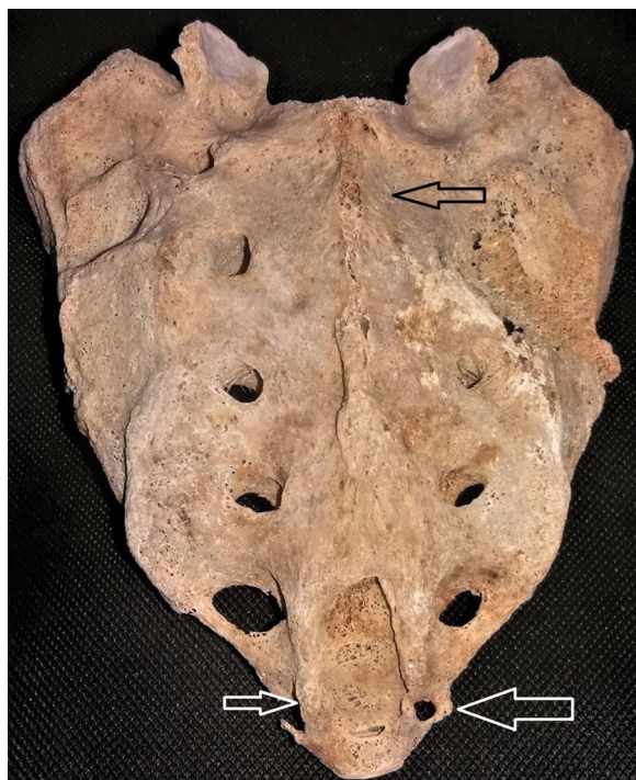
Figure 2. Posterior surface of the sacrum. Dual sacral-coccygeal (white arrows) and sacral-lumbar (black arrow) fusions are observed. The unilateral sacral cornua-coccygeal cornua fusion is indicated with the small white arrow and the unilateral sacrum-transverse process of coccyx fusion is indicated with the big white arrow. The posterior right side of the sacrum appears slightly damaged.

separately, with or without the existence of supernumerary sacral foramina are abundant, the presence of both of them is a rare finding. The significance of this case is dual: the 2 synostoses and the existence of 6 sacral foramina. Coccygodynia and symptoms due to neurological or biomechanical malfunction could possibly be explained by the presence of this anatomical variation [2].