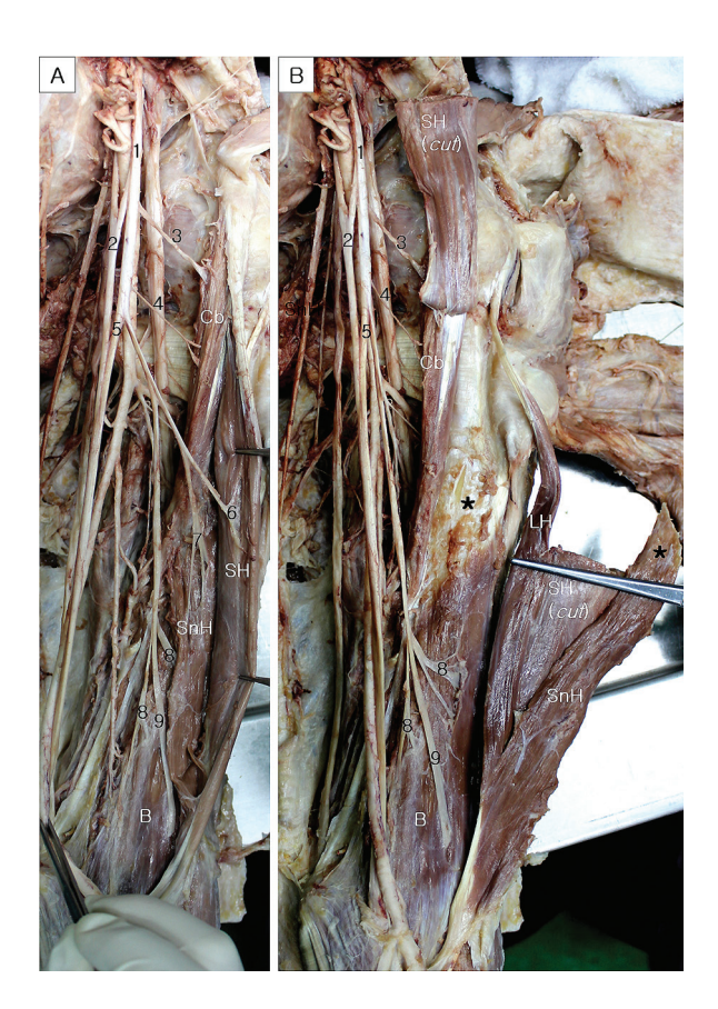
Figure 1. Dissection of the combined neuromuscular variations of the supernumerary head (SnH) of the biceps brachii muscle and a communicating branch of the musculocutaneous nerve before ( A ) and after ( B ) reflecting the biceps brachii muscle; 1 — musculocutaneous nerve; 2 — median nerve; 3 — nerve to coracobrachialis; 4 — nerve to coracobrachialis; 5 — communicating branch from the musculocutaneous nerve; 6 — nerve to biceps brachii; 7 — nerve to SnH; 8 — nerve to brachialis; 9 — lateral cutaneous nerve of forearm; Asterisk — proximal attachment of SnH; B — brachialis; Cb — coracobrachialis; SH — short head of the biceps brachii; LH — long head of the biceps brachii.

and it conformed to the provisions of the Declaration of Helsinki in 1995. Gross dissection was performed in the customary fashion. Accidental injury on the left upper arm was ruled out as no incision or injury marks were observed on the skin of the arm.