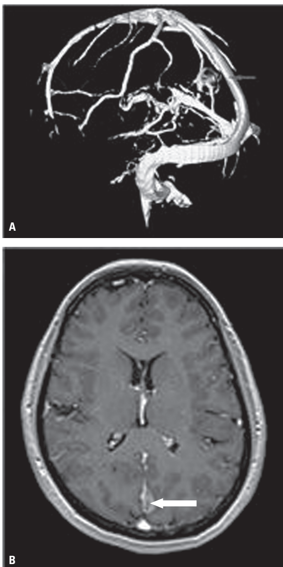
Figure 1. Meningioma along the posterior portion of the falx (arrow); A. Magnetic resonance 2D venography; B. T1 3D post gadolinium.