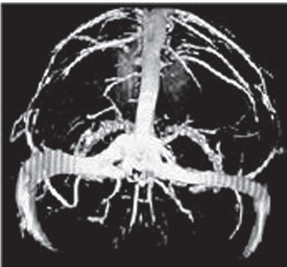
Figure 4. Normal appearance of the lateral sinus.

The evolvement of the encephalic veins and their extracranial drainage is Daedalean in humans [14]. The main vessel network of the early embryo advances in three layers. The superficial vessels drain into the external jugular vein as the middle and deep vessels derivate into the IJV. Emissary veins are composed of the remaining connections between the superficial and middle layers and may be crucial for the foetal circulation. They emanate from the sigmoid sinus and constantly on the left side, thus the emissary veins play a major role in the equalisation of the intracranial pressure and can act as safety