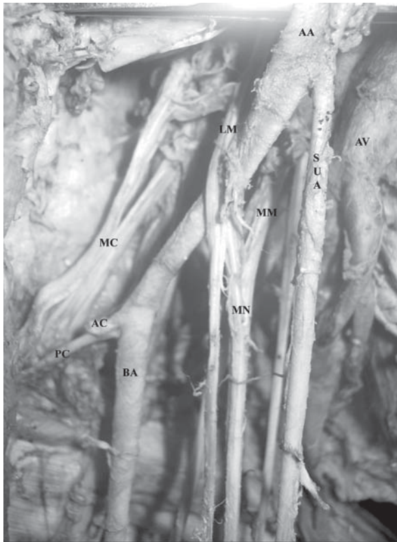
Figure 2. The right superficial ulnar artery (SUA) arising from the axillary artery along with the subscapular artery; AC — anterior circumflex; AA — axillary artery; AV — axillary vein; BA — brachial artery; MM — median root of median nerve; LM — lateral root of median nerve; MN — median nerve; MC — musculocutaneous; PC — posterior circumflex.

[16] in which on the left side the SUA passed deep to the median nerve. In the present case the SUA ran in the subcutaneous plane in the forearm that was superficial to the forearm flexor muscles. Some authors [15] described it as the sub-fascial or subcutaneous plane out of which the sub-fascial course is more common. On the distal end of the forearm on both sides the SUA lay between the flexor carpi ulnaris and ulnar nerve and entered the hand deep into the flexor retinaculum. In the hand the SUA participated in the formation of superficial palmar arch deep into the palmar aponeurosis, which was the usual course of the artery. This sub-fascial plane of the artery was found on the left side, but on the right side it was found below the sub-fascial plane.