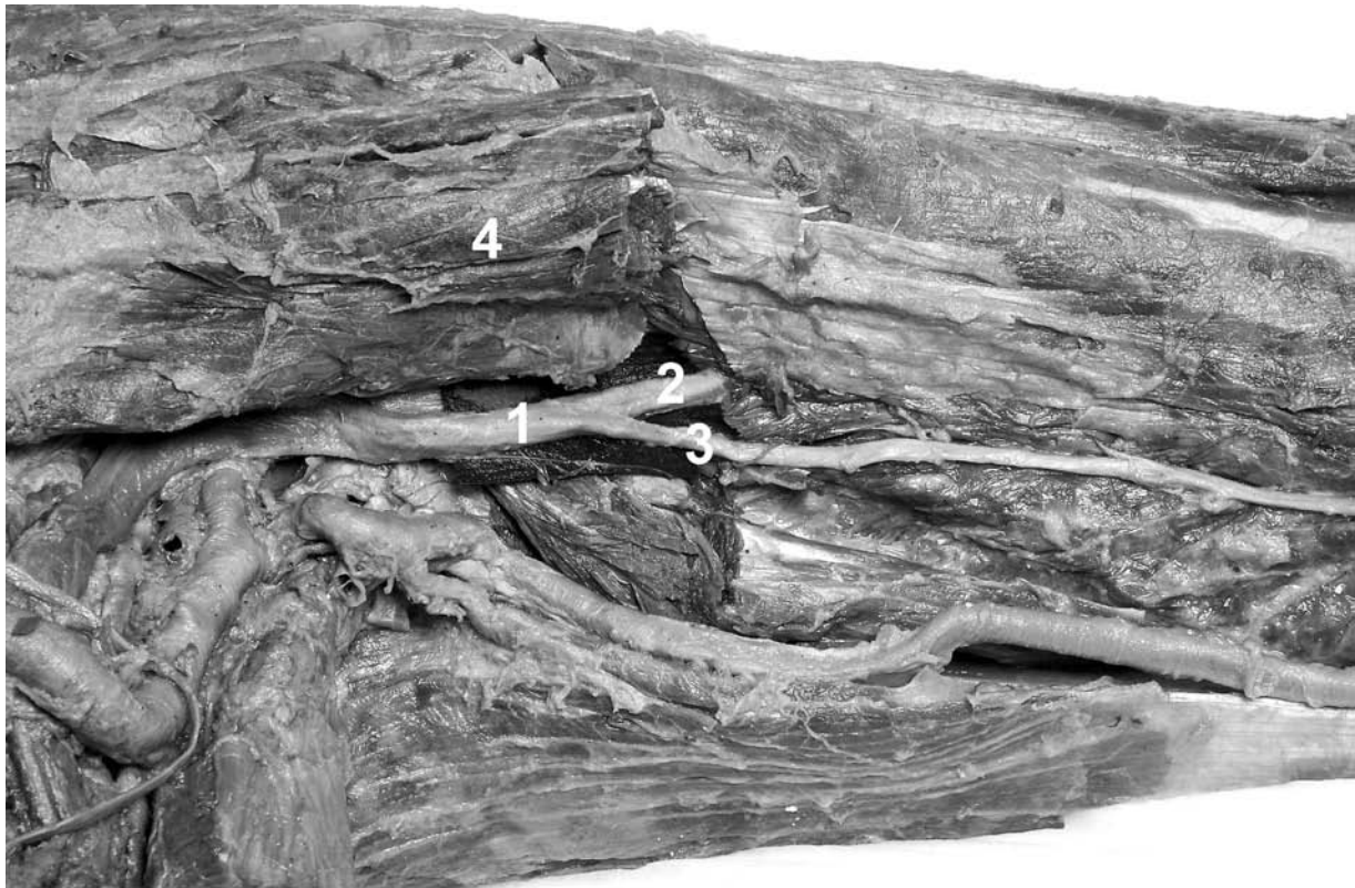
Figure 1. The bifurcation of the median nerve in the cubital fossa — first case; 1 — median nerve; 2 — major branch; 3 — minor branch; 4 — ulnar head of the SDFM (pulled away).

Before crossing the superficial palmar arch from below, the minor branch receives two connecting branches: one from the ulnar nerve and the second the afore-mentioned communicating branch from the major branch. Finally the minor branch divides into two proper digital nerves, which innervate the lateral part of the of the fourth finger and the medial part of the third finger (Fig. 2).