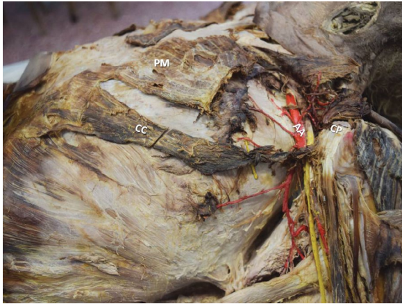
Figure 2. Left axillopectoral area. The abdominal portion of pectoralis major (PM) is an accessory pectoral muscle named the chondrocoracoideus muscle (CC) emerging by three slips from the 6 th to 8 th ribs and the external oblique muscle aponeurosis, and inserted onto the coracoid process (CP) after its fusion with the tendon of the short head of the biceps brachii; AA — axillary artery.

slips from the 6 th –8 th ribs and the EOM aponeurosis. At the level of the 5 th and 6 th ribs, the accessory muscle was fused to the PM sternocostal portion and inserted into the CP after its fusion with the tendon of the BB short head. The CC was innervated by the medial pectoral nerve, and supplied by the lateral thoracic artery [90]. The incidence of both muscles in our sample was 2.08% for each one of them. No LAA, Pq, Pm and CE were found in any of the cadavers that we dissected.