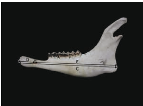
Figure 2. Lateral view of the mandible of the Madras Red sheep; C — length of the mandible; D — distance from the lateral root to the mental foramen; E — distance from the mental foramen to the caudal border of the mandible.