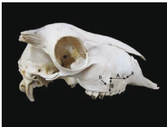
Figure 1. Lateral view of the skull of the Madras Red sheep; A — distance between the facial tuberosity to the orbital canal; B — distance from the infraorbital canal to the root of the alveolar tooth; a — infraorbital foramen; b — facial tuberosity.

A total number of 40 live apparently healthy adult Madras Red sheep (20 males and 20 females) without any skeletal deformation were first selected during ante-mortem examination at Chennai City Corporation Slaughter House, Perambur, Chennai. The animals were weighed and the age was estimated through