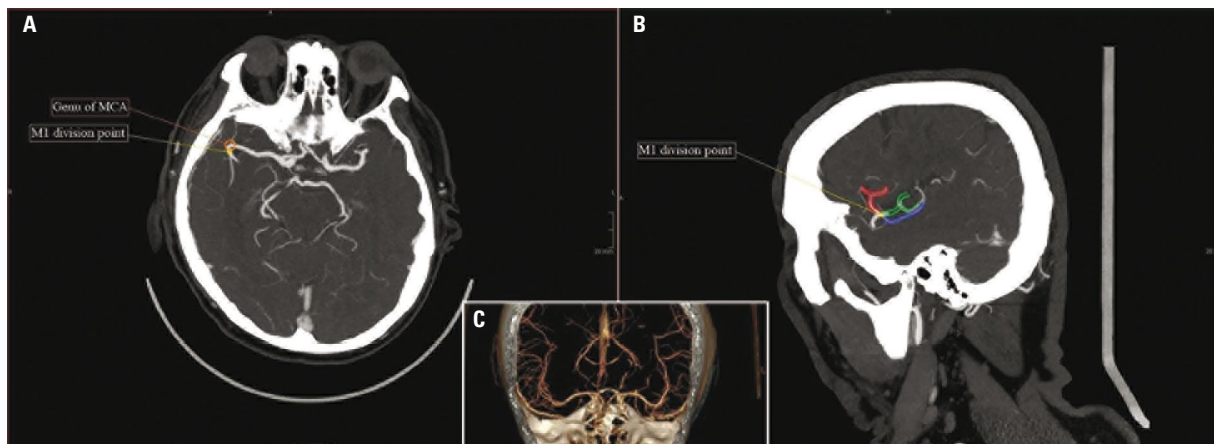
Figure 1. Radiological documentation of middle cerebral artery (MCA) anatomy evaluation; A. Maximum intensity projection (MIP) reconstruction of sagittal plane, showing MCA division point; B. MIP reconstruction of transverse plane, showing MCA genu and measurement of M1 length. MCA domination was assessed in both planes; C. Three-dimensional reconstruction useful in more complicated cases.