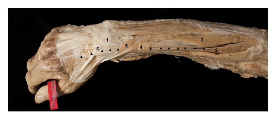
Figure 3. Cadaver C; right extensor carpi radialis intermedius; abbreviations as in Figure 1.

ECRB and ECRL tendons. The insertion lay medial to ECRL and lateral to ECRB on the lateral part of the base of the second metacarpal. The muscle