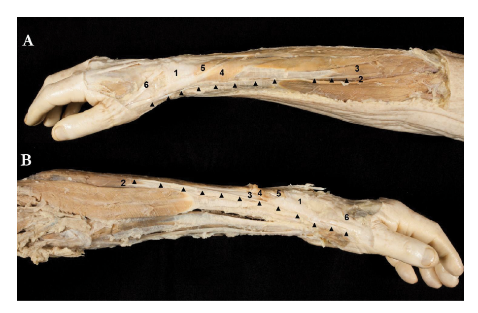
Figure 4. Cadaver D; A. right extensor carpi radialis accessorius; B. Left extensor carpi radialis accessories; abbreviations as in Figure 1.