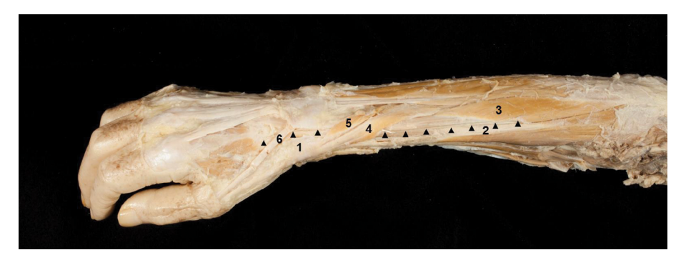
Figure 2. Cadaver B; right extensor carpi radialis intermedius; abbreviations as in Figure 1.