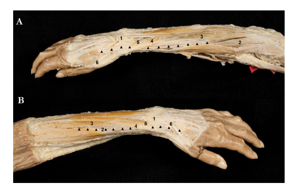
Figure 1. A. Cadaver A; right extensor carpi radialis intermedius; B. Left extensor carpi radialis intermedius; 1 — extensor retinaculum; 2 — extensor carpi radialis longus; 3 — extensor carpi radialis brevis; 4 — abductor pollicis longus; 5 — extensor pollicis brevis; 6 — extensor pollicis longus; additional radial wrist extensors are denoted by black triangles.