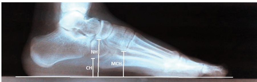
Figure 1. Measurement of navicular height (NH), cuboid height (CH) and medial cuneiform height (MCH).