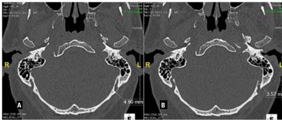
Figure 1. Non-enhanced axial computed tomography scan in a patient showing the diameter of the mastoid foramen (A) and the diameter of the canal of the mastoid emissary vein (B).

venous drainage of the neurocranium. When the normal routes of venous drainage are patent, the role of emissary veins is limited. They may be the primary outflow pathway in patients with intracranial hypertension, high-flow vascular malformations or hypoplasia/aplasia or occlusion of the internal jugular veins [10, 11, 16, 17, 22]. The mastoid emissary vein (MEV), posterior condylar vein, occipital emissary vein, and petrosquamosal sinus (PSS) are the major posterior fossa emissary veins of clinical importance.