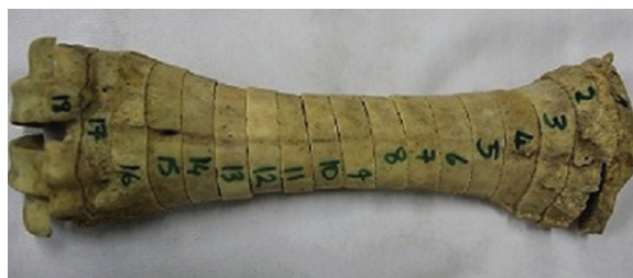
Figure 1. Cross-sections of metapodia.

The cross sections were lined up for placing point counting great on their top (Fig. 3). The grids were randomly thrown on top of the cross sections and the points on the cross sections were counted. Using these data, whole bone volumes and medullary cavities volumes were calculated as a spreadsheet using Microsoft Excel® program. Mean value, standard de-