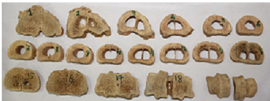
Figure 3. The cross-section of the bones lined up for superimposition of the grid membrane.