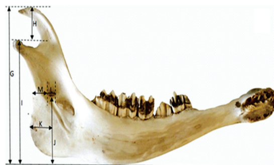
Figure 2. Medial view of the mandible of Kuri cattle; G — Mandibular height (MHMD); H — maximum height to condyloid fossa (MHCF); I — base of mandible to condyloid fossa (BMCF); J — mandibular foramen to base of mandible (MDFB); K — caudal border to vertical line (CBMV); L — mandibular foramen width (MDFW); M — mandibular foramen to caudal mandibular border (MDFCB).