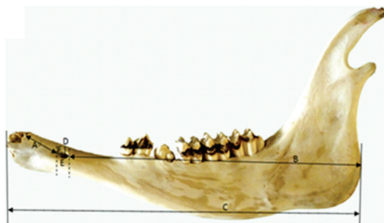
Figure 1. Lateral view of the mandible of the Kuri cattle; A — lateral alveolar root to mental foramen (LARM); B — mental foramen to caudal mandibular border (MFCM); C — mandibular length (MDL); D — mental foramen to diastema (MBMD); E — mental foramen height (MFH); F — mental foramen width (MFW).