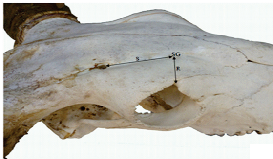
Figure 4. Dorso-lateral view of the skull of Kuri cattle; R — mid-dorsal brim of the orbit to a point „SG” in the supraorbital groove (DMOSG); S — supraorbital point „SG” caudally to supraorbital foramen (SGSOF).