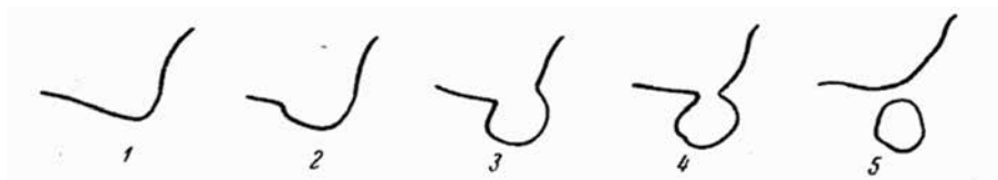
Figure 1. Types of suprascapular notch (SSN) (the scheme is taken from Alekseev's handbook [2]). Types: 1 — the superior border of the scapula passes smoothly into the base of the coracoid process without a depression; 2 — the march of the superior border towards the end of SSN is clearly pronounced, but the notch is shallow; 3 — the SSN is deep and its border outlines approximately 3/4 of the circumference; 4 — the border of the SSN outlines nearly full circumference; 5 — the SSN is converted into a complete bony foramen.

for different contemporary populations. However, there are scarce or missing data about this topic in the ancient populations as well as about the sexual differences in the distribution of the types of SSN. Therefore, the aim of this study is to determine the frequency of different types of SSN, based on its shape, in male and female medieval skeletal series and to assess the sexual differences.