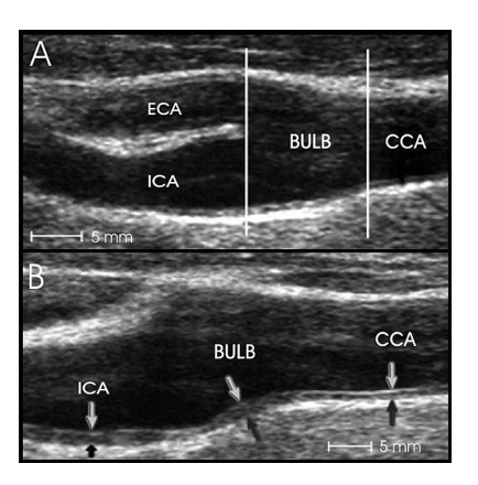
Figure 1. A. High-resolution ultrasound longitudinal image of the distal common carotid artery (CCA), the bulb (bifurcation), the proximal internal (ICA) and external (ECA) carotid arteries as defined by the study protocol; B. The arrows indicate intima-media thickness on the far wall of the carotid artery segments.

The carotid IMTs were assessed, by the same sonographer (R.K.), as previously described [17]. In brief, for the purpose of the evaluation, the carotid artery was divided into 3 segments based on arterial anatomy. The first segment included the distal 2-cm of the vascular wall of the common carotid artery (CCA) immediately proximal to the dilatation of the bifurcation. The second segment, the carotid bulbs (BULB), was defined as the segment between the carotid dilatation and the flow divider of the internal and external carotid arteries. The third segment, the internal carotid artery (ICA), was defined as the segment immediately distal to the tip of the flow divider over a 1 cm distance. The loss of the parallel wall configuration, which marks the origin of the bulb segments, was easily identified as a consistent marker of the distal end of the CCA segment (Fig. 1).