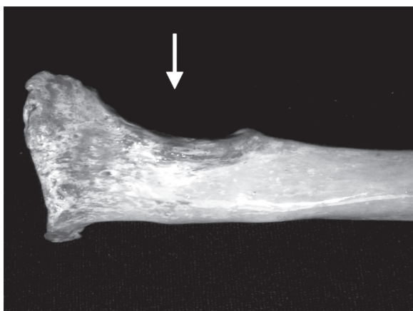
Figure 1. Excavated type of rhomboid fossa (arrow) of the inferior surface of the sternal end of the clavicle, as seen in a macerated bone.