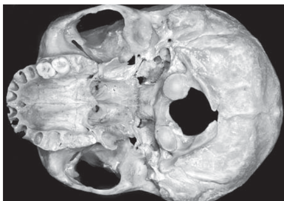
Figure 1. Inferior view of the basicranium with assimilated atlas.

Visual inspection of the basicranium revealed an obvious anomaly within the region of the foramen magnum, which appeared as the fusion of the first cervical vertebra (the atlas) with the occipital bone (Fig. 1). Abnormal ossification took place between the anterior arch (particularly the left portion), the body of the occipital bone, and both lateral masses with the occipital condyles, and the left portion of the posterior arch with the occipital squama, along the edge of the foramen magnum (Fig. 2). The posterior arch of the atlas was incomplete in the midline, and its right portion was not united with the occipital bone (Fig. 3). Both the left and right supe-