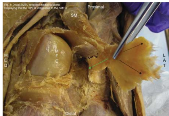
Figure 2. The distal semimembranosus muscle-tendon-unit reflected at its most distal attachment demonstrating that the oblique popliteal ligament is indigenous to this tendon; SM — semimembranosus muscle; MFC — medial femoral condyle; — — — — — Oblique popliteal ligament (expansion); · · · · · Anterior expansion; — — — — — Direct expansion.

The posterior aspect of the knee has been studied increasingly because of its clinical relevance. Surgeons, biomechanists, physical therapists, all health care providers dealing with the musculoskeletal system, and anatomists need to have a definitive and precise understanding of the morphology of the distal SMTU. This study revealed a consistent trifurcation with three distinct limbs. This enabled accurate anatomical terminology to be used by all clinical and educational health care providers. Furthermore, this study strongly proposes the change of terminology from OPL to tendon. This is clinically important because of the proprioception of a tendon vs. a ligament. This may sug-