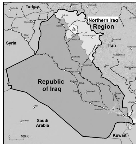
Figure 2. Northern Iraq Map

Those four governorates cover approximately 40,000 square kilometers which is larger than the Netherlands, Bahrain, and four times the area of Lebanon. This include the governorates administered by KRG, but does not contain areas of Kurdistan outside of KRG administration, such as Kirkuk (Soderberg, and Phillips, 2015).