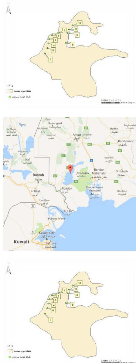
Figure 1. The location of the Shadegan wetland (left), and the locations of the sampling stations within the wetland (right).

Ramsar Settlement in 1972. (Nasirian et al., 2015)