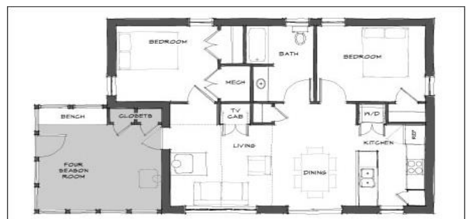
Figure 4. Mini House Floor Plan.

Second (lower floor): The lower floor has two guest bedrooms, one of which might be used for an office, and a bath. At the rear, there is a large storage and utilities room. For those who might need it, this floor could also be used as separate living space for a caregiver.