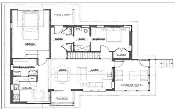
Figure 2. The Community Building, Upper Floor.

Nestled into the hillside will be 17 south-facing houses in two clusters. The lower cluster of 12 three-quarter-acre lots will comprise Phase I along Crosier Lane; Phase II the upper five-lot cluster along Stowe Farm Lane. Between the two clusters is the existing house, a large redwood home built in 1972 with five guest rooms, a large party or meeting space, kitchen, library, and workshop. This building will serve, at least for the time being, as the community house.