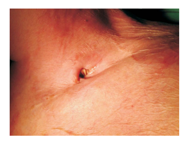
Figure 1. Fistula in the scar on the neck with visible vascular prosthesis in the bottom of the wound

90 years old patient was admitted to the Clinic as an urgent case due to haemorrhage from the injury in the scar after carotid-subclavian bypass performed a long time ago. The patient estimated the loss of blood at about "two glasses". In the Clinic blood loss was not observed. It occurred in this scale for the first time. The purulent fistula on the neck occurred 5 years earlier. At first it was only a little leak of serum matter and then pus from a small opening in the middle of the scar above the left clavicle. Over time the opening of the fistula gotten bigger. At its bottom vascular prosthesis appeared and periodically minute amounts of blood was found. The patient was under the care of the