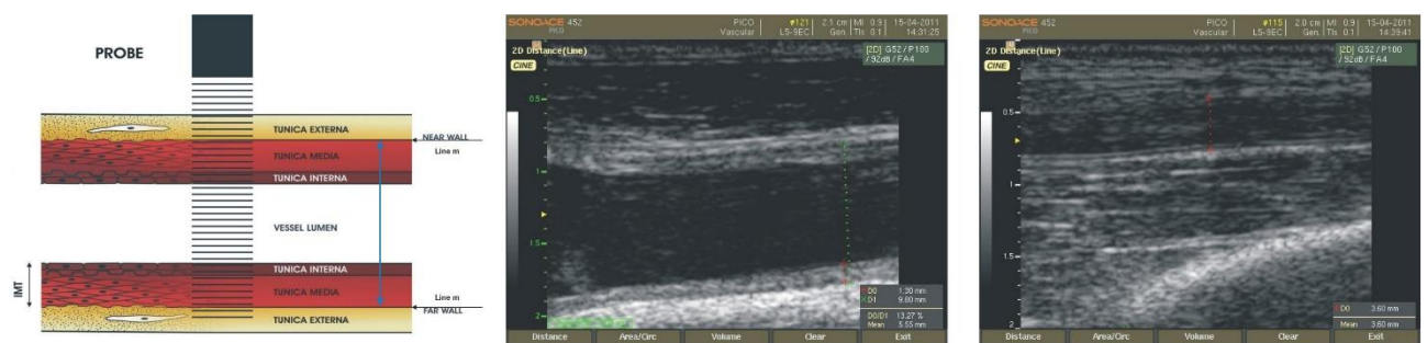
Figure 1. The principle of measuring the diameter of examined peripheral arteries and sample measurements of common carotid artery diameter and measurement of brachial artery diameter.

of vessels was performed in their longitudinal projection. The study was performed at approximately 10 mm proximal to the carotid bulb. With regard to the evaluation of brachial artery diameter of dominant arm measurement was taken at 5–10 cm above the bottom of the elbow. The diameter of the examined vessel was determined by averaging 5 heart cycles — Figure 1.