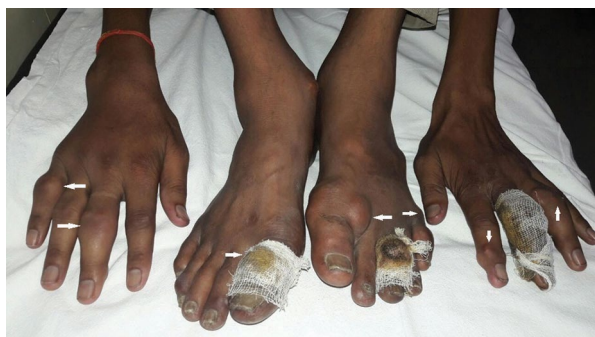
Figure 1. Photograph of both feet and hands showing joint swelling and tophi (white arrows)

Gout, an inflammatory arthritis, is caused by an accumulation of monosodium urate crystals (MSU) in the joints and soft tissues when serum uric acid concentrations rise above the physiological saturation limit ( \geq 6.4 mg/dL) [1]. Imaging tools and clinical presentation together help in establishing the diagnosis in the absence of a histological diagnosis, and also in assessing the burden of disease.