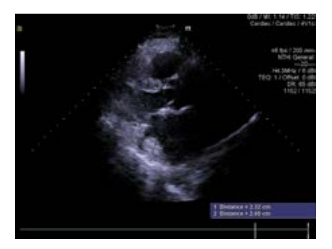
Figure 1. Transthoracic echocardiogram (TTE) — remarkably enlarged left atrium and a large thrombus (23 \times 21 \text{ mm})