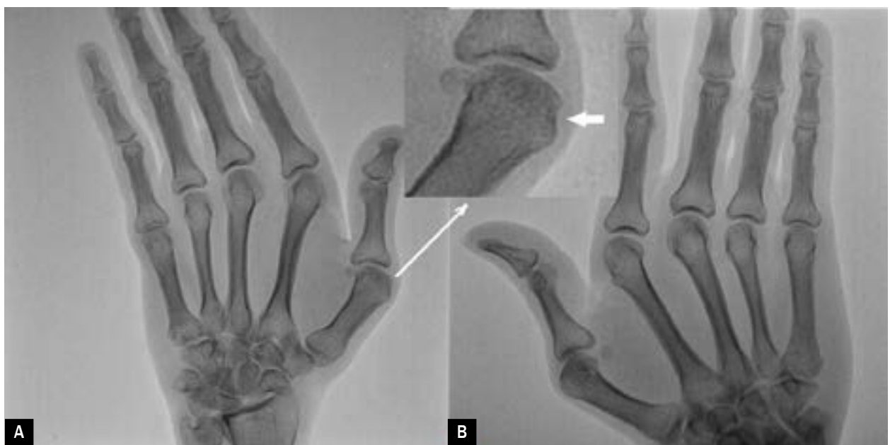
Figure 4A, B. Plain radiograph of both hands showing non-erosive deformities (inset view shows probable 'hook' lesion on radial aspect of first left metacarpal head – white arrow)

limitation may be noted probably secondary to local residual fibrosis leading to contractures. Therefore, at this stage, it may be misdiagnosed as rheumatoid arthritis. Clinically significant tenosynovitis has rarely been described in JA, probably because other features of the disease overshadow the symptoms related to the tendon sheaths, but in some patients crepitus can be detected. The deformities in JA are