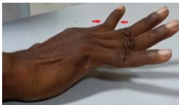
Figure 2. Swan neck deformity in Jaccoud's arthropathy of right hand in lateral view (red arrow)