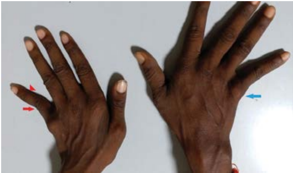
Figure 3. Swan neck deformity (red arrow and arrowhead) along with 'z-deformity' (ulnar deviation – blue arrow) in Jaccoud's arthropathy of both hands